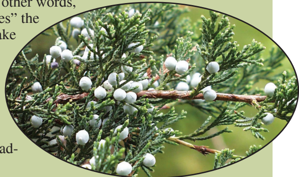
Eastern redcedar produces a berry that birds enjoy as well as beautiful wood. In many parts of the state, it is one of the first trees to invade abandoned agricultural land.