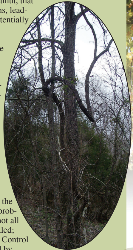
Wild grape is an important wildlife food, but the vines can be very damaging to timber trees.