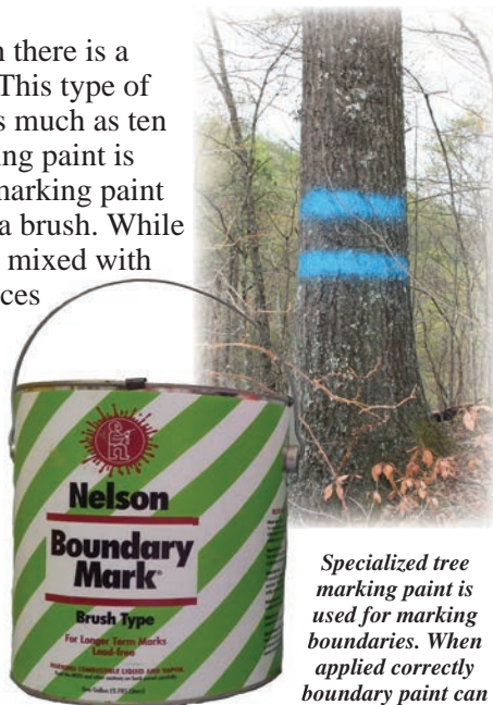
Specialized tree marking paint is used for marking boundaries. When applied correctly boundary paint can last ten years.

It takes longer to paint trees using boundary-marking paint, as you must be within arm's length of each tree you intend to paint. Boundary marking is inherently messier than tree marking, as carrying a gallon can around in the woods is no easy task. As implied by the name, boundary-marking paint