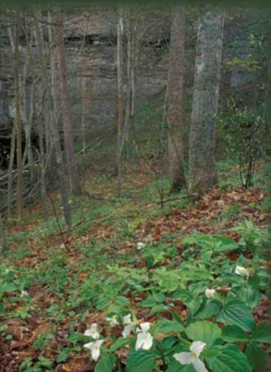
Carter Caves in Carter County.

Kentucky Division of Forestry 627 Comanche Trail Frankfort, KY 40601 502.564.4496 www.forestry.ky.gov