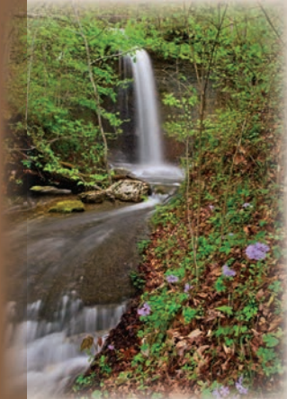
Dr. Barnes will show attendees the fundamentals of taking nature photographs.

Then at 12:30 p.m. you can learn how to put your camera to work as Dr. Tom Barnes presents Nature Photography . Participants will be introduced to the concepts and principles of making outstanding nature photographs, ranging from close-ups of flowers to wide-reaching landscapes and wildlife. Basic concepts related to light and composition will be emphasized and example photographs will be used to highlight concepts. Learn about the art and science of nature photography and what makes a good photograph.