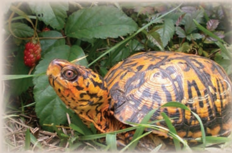
Amphibians and reptiles are common components of Kentucky's forests.