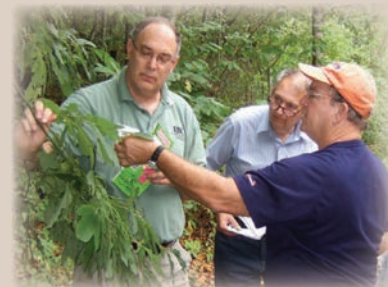
Learn how to identify trees at the Expo.