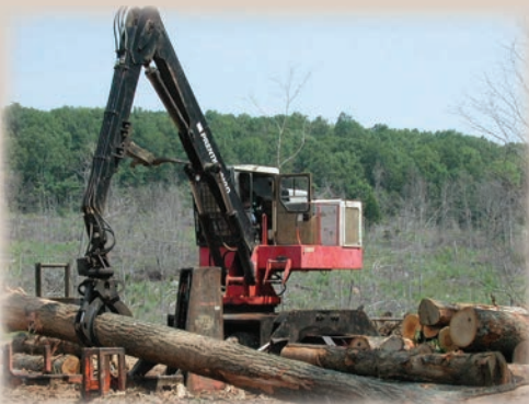
Expo attendees will see heavy equipment in action such as this knuckleboom.

Expo attendees can see heavy equipment in action during the annual Skidder and Knuckleboom competitions. Any qualified person 18 years or older may participate in these competitions. The skidder contestant must pull three logs through an obstacle course of cones without knocking them over. Knuckleboom competitors must stack num-