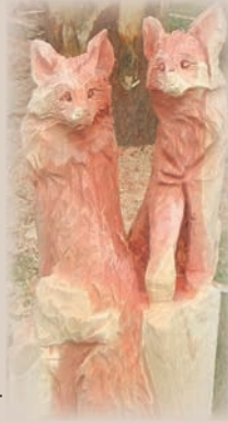
Chainsaw carvers will be creating works of art like the above at this year's Expo.

Several events will be held continuously throughout both days such as sawmill and heavy equipment demonstrations, craft and food booths, and music. A truck totally powered by wood will also be on display. Those who participate in the cutting board workshop will receive a beautiful hardwood cutting board made from local Kentucky grown trees to drill, sand, and finish on-site. While participating you will learn how important the wood industry is to Kentucky's economy. Cutting boards are being donated by Kentucky Forest Industries Association members and the University of Kentucky Department of Forestry.