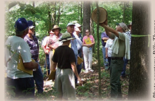
Participants at the WOSC will learn a variety of forestry-related topics teaching them how to manage their woodlands.

bered logs in a designated area and return them to their designated area all within an allotted time frame. Don't miss out on this exciting opportunity to experience all things wood at this year's Expo. For a full schedule of events or to order advance tickets, contact KFIA at 502.695.3979. The Expo is open from 9 a.m. to 7 p.m. on Friday and from 8:30 a.m. to 4:30 p.m. on Saturday. Admission is $7 ($5 in advance) at the gate for adults and $5 for children 6 to 12 years old (under 6 are free). For more Expo information visit www.kywoodexpo.org .