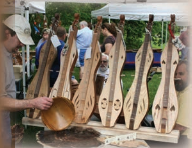
Several Kentucky craftsman will be at the Expo showcasing their talents.