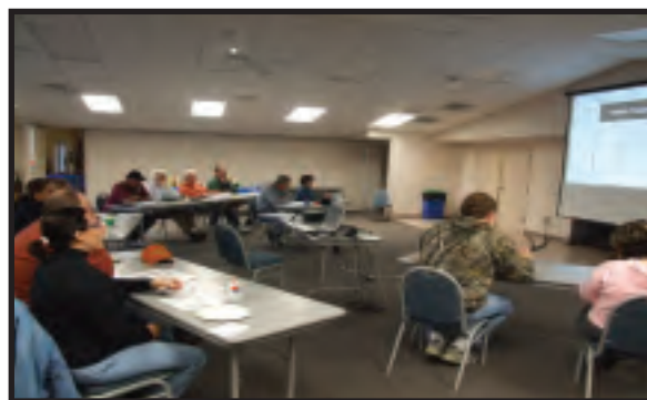
Master Tree Farmer participants at the Trimble County Extension Office. This webinar series allowed woodland owners to attend a statewide educational program without having to leave their county.

Based on the positive feedback and continually shrinking budgets you can expect to see more of these web based educational programs in the future. Be sure to check out the next issue of Kentucky Woodlands Magazine for a listing of fall programs!