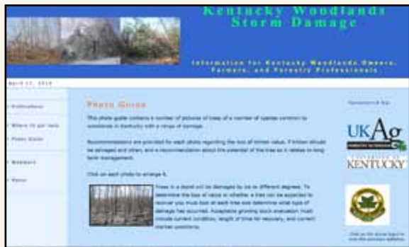
Photo Guide: The photo guide contains images of a variety of storm damage on common Kentucky trees. Estimates are provided for each photo regarding the loss of timber value, if timber should be salvaged and when, and an evaluation of the trees potential for long-term management.

The past several years have been hard on our woodlands. Whether an ice or wind storm, or tornado our woodlands have suffered some losses. What about your woodlands? Would you know where to get help when or if you needed it? Below are some resources to help you with your timber damage issues. We encourage you to utilize these resources whenever you experience storm damage to your timber. Visit www.kytimberdamage.net for the following resources: