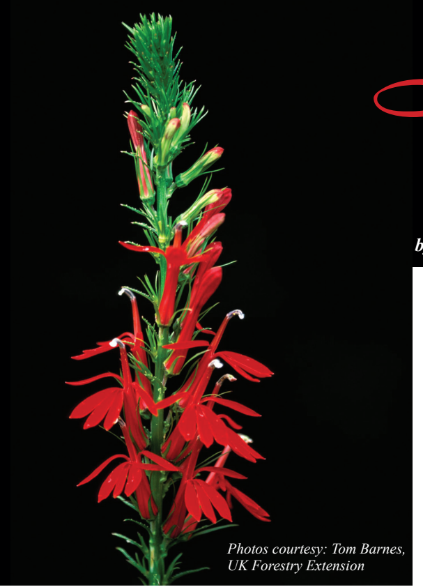
The cardinal flower is an attractive wildflower that is popular with humming birds and butterflies. However, humans that consume large quantities can suffer from nausea, vomiting, diarrhea, weakness, convulsions, and ultimately a coma.