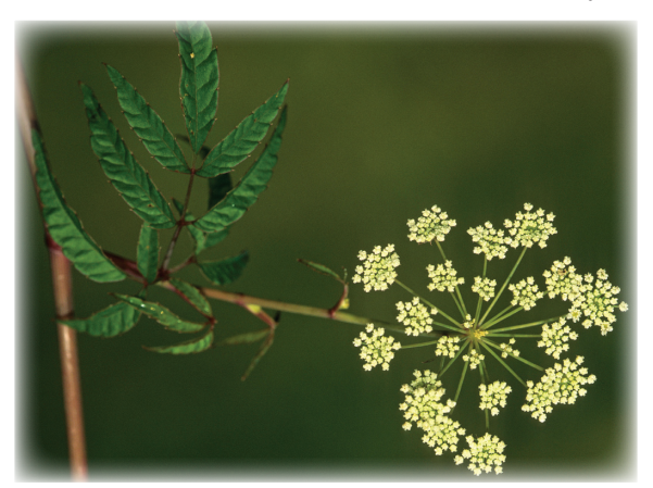
Water hemlock is a plant that grows in wet or moist areas and can be found along stream banks. This plant is considered one of the most violently toxic plants that grows in the United States.

to poison control centers because people, mostly children, have eaten toxic plants. Two plants, poison hemlock and water hemlock, account for most of the calls. So, just how toxic are these plants to people? About two bites of a water hemlock root will kill you deader than a mackerel, and in pretty short order, or about 60 minutes. About 30% of people who consume water hemlock die. The first symptoms of this disease occur in the gastrointestinal tract, with abdominal pain,