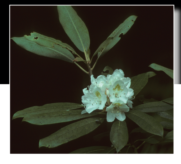
Rhododendron (left) and azaleas (right) are closely related plants that can easily be found in woodlands or planted near homes as ornamentals. Both are considered very toxic and should not be consumed.