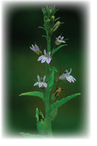
Indian tobacco, which can be found in fields and open woodlands, was used by Native Americans to address respiratory issues. All parts of the plant are considered poisonous and large quantities can be toxic.

These are just a few of the interesting and potential toxic plants that occur in our woodlands. The next time out you might ask yourself: Is that cherry tree leaf toxic? Yes. Is that sourwood tree leaf toxic? No, even though it is in the same family as rhododendrons. Then you will begin to understand how plants affect people.