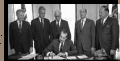
Hint: See article on page 5.