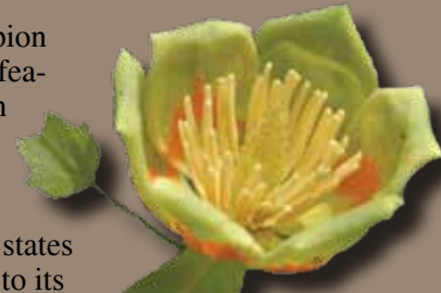
Hint: See article on page 22.