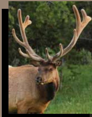
Hint: See article on page 10.