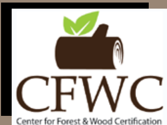
Hint: See article on page 20.

Scan this code with your smartphone or tablet device to submit your answers.