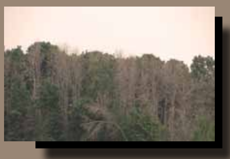
Hint: See article on page 4.