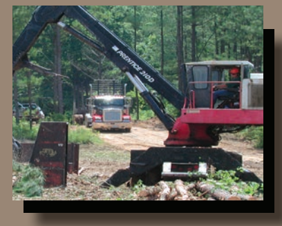
Hint: See article on page 18.